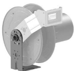
Fixed mounting bracket (suitable for floor, ceiling or wall mounting)