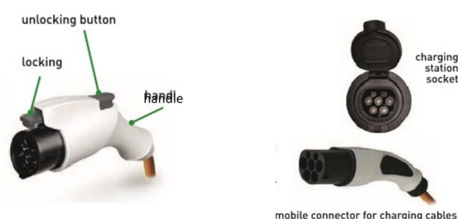
TYPE 1 SAE J1772-2009