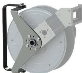
Swivel mounting bracket (suitable for wall mounting)