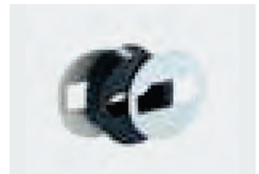
Neoprene rubber compression inserts