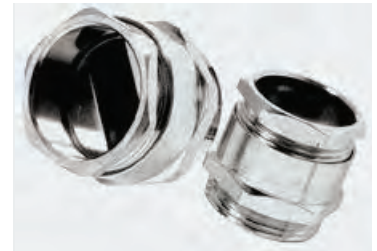
Nickel plated brass glands